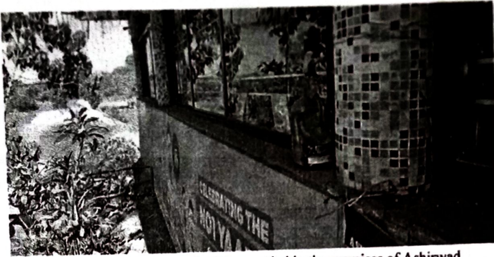
Image 3: Onsite Photograph of dust settled in the premises of Ashirwad Family Bar and Restaurant